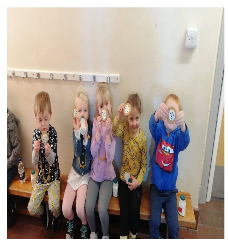
One of the highlights of our School calendar – this year the children raised £198.35!!!!!Absolutely fantastic!!!